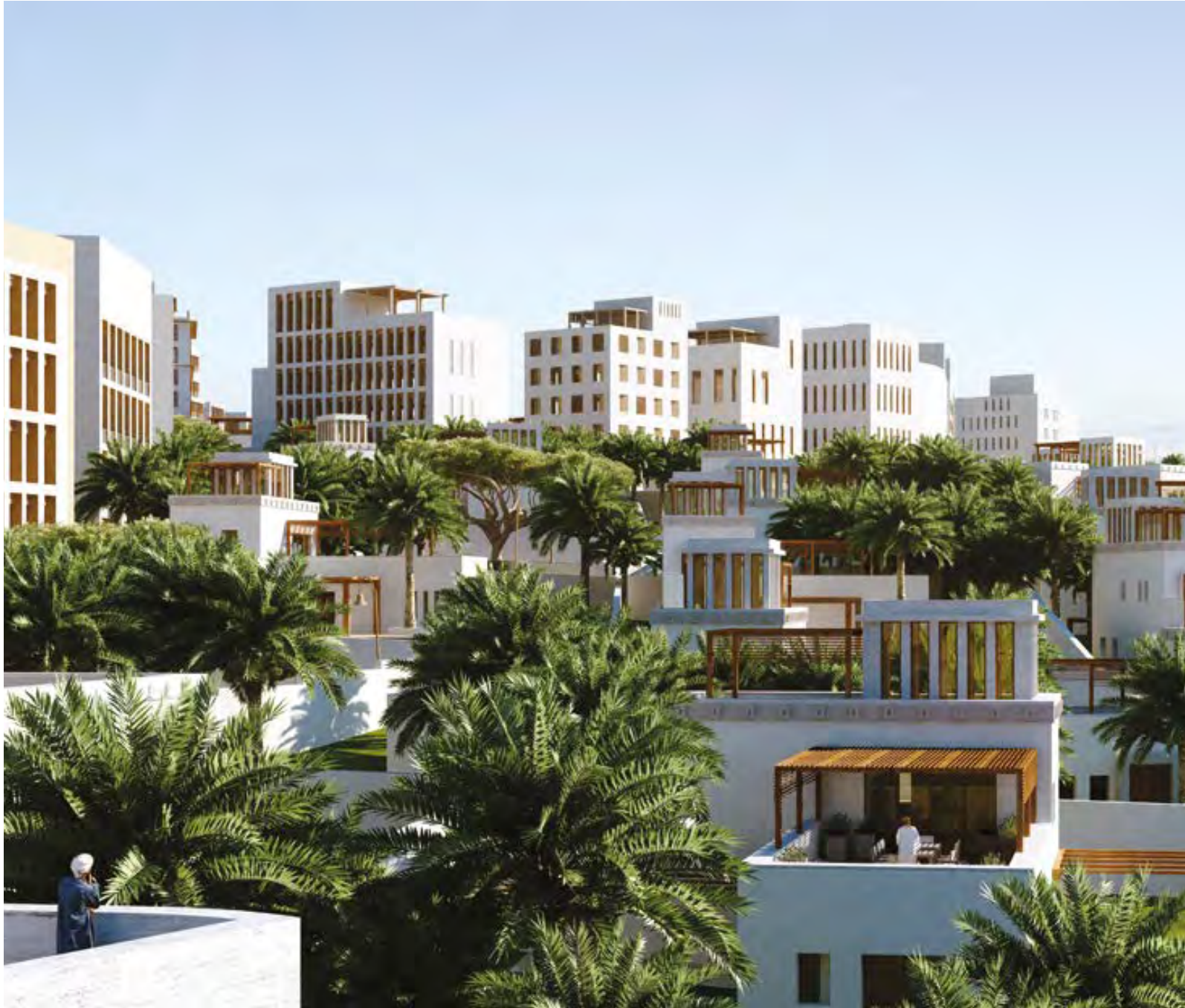
Tilal Al Irfan by Majid Al Futtain